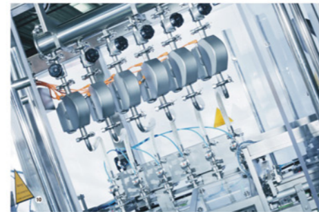
质量流量计灌装系统 Mass flowmeter filling system