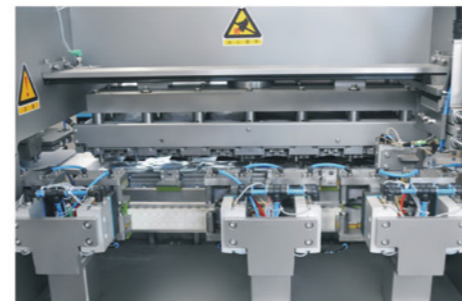
预热、成型 Preheating, forming