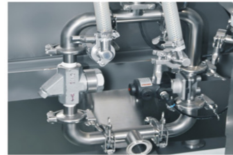
在线CIP/SIP功能 Online CIP/SIP