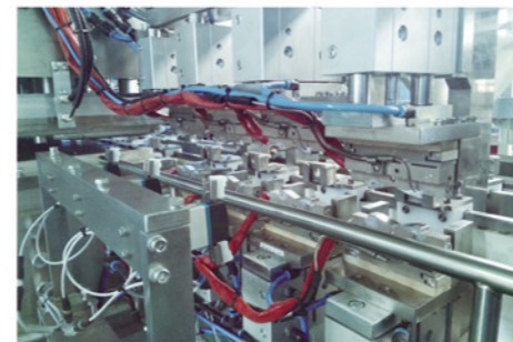
接口焊接、膜冷却、去倒角 Interface welding, film cooling, chamfering